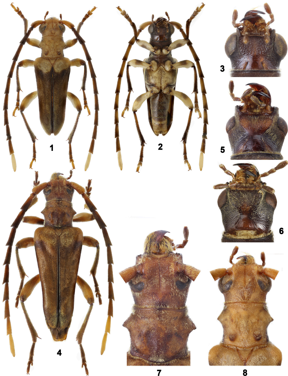
Figs 1–8. Trypogeus Lacordaire, 1869, males.

1–3, 8 – T. pygmaeus sp. n., holotype; 4–5, 7 – T. superbus Pic, 1922; 6 – T. gressitti Miroshnikov, 2014, holotype. 1–2, 4 – habitus; 1, 4 – dorsal view, 2 – ventral view; 3, 5–6 – head, ventral view; 7 – head and pronotum; 8 – head, pronotum and base of elytra.